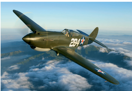
AHM's P-40 B Tomahawk This is the world's last flying American fighter that survived the attack on Pearl Harbor.

Examine the consequences of the war, including the reshaping of international relations and the emergence of the United States as a global superpower.