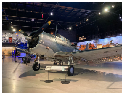
AHM's Dauntless SBD Dive-Bomber. This bomber aircraft was pivotal in the Battle of Midway and other Pacific Battles.