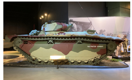
AHM's LVT(A)-4. Landing Vehicle Tracked. This is the only one of this type on display in North America. Important armored vehicle that enabled soldiers to drive over reefs to get to the islands.